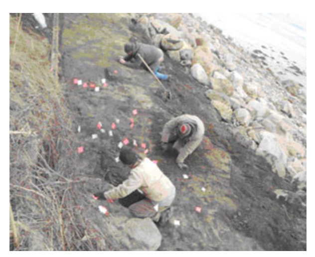
Researchers from Rhode Island University were not expecting a discovery of such a controversial nature

The four skeletons that have been found on the site are in a state of advanced decomposition which could make DNA testing impossible, warns the expert, although the teeth showed premature decay which could explain the cause of death by a poor diet or an unknown illness.